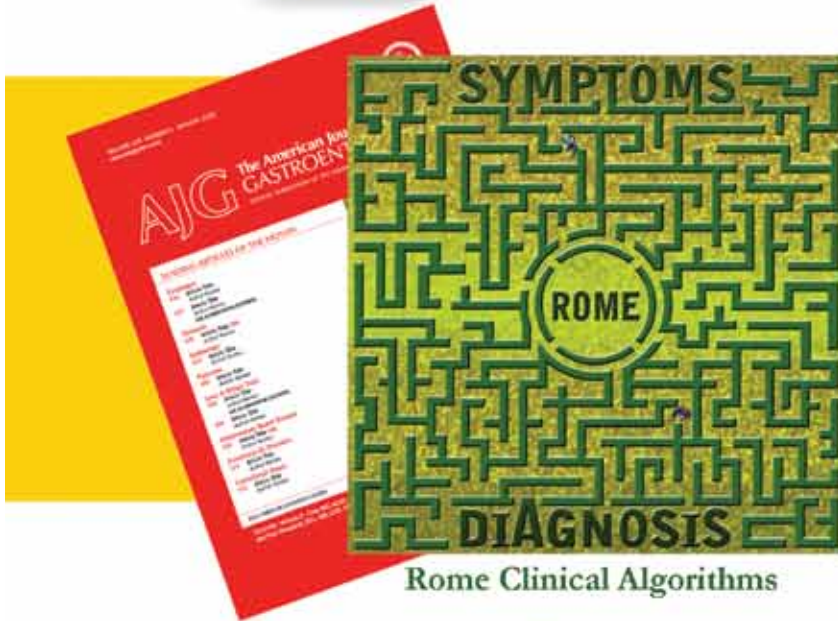
Rome Clinical Algorithms

the latest educational resources for all health care professionals and patients concerned with functional gastrointestinal disorders (FGIDs)