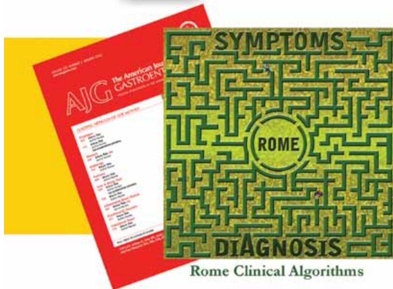
Rome Clinical Algorithms

the latest educational resources for all health care professionals and patients concerned with functional gastrointestinal disorders (FGIDs)